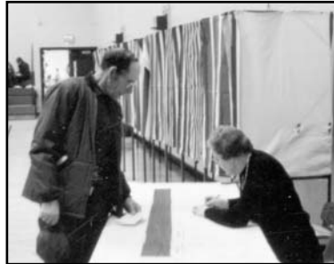
Williamstown town meeting, 1977.